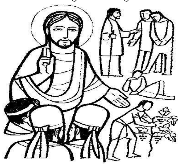
The Power of Truth